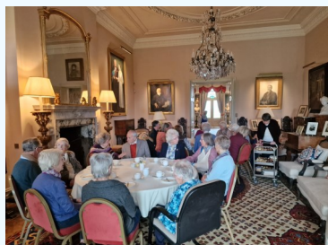
Some Friends at the AGM & Coffee Morning

The Annual General Meeting was again very well attended and the Coffee Morning, with homemade cakes which followed, was enjoyed by all.