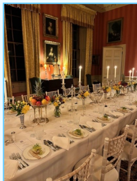
The Dining Room arrangement for private functions