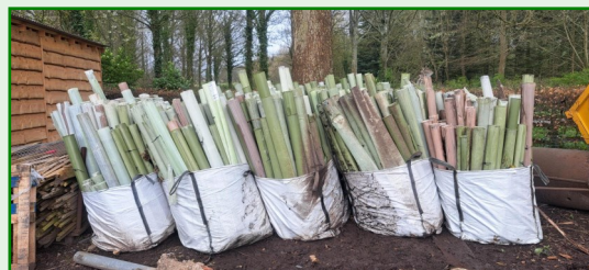
Plastic Tubes ready for Recycling